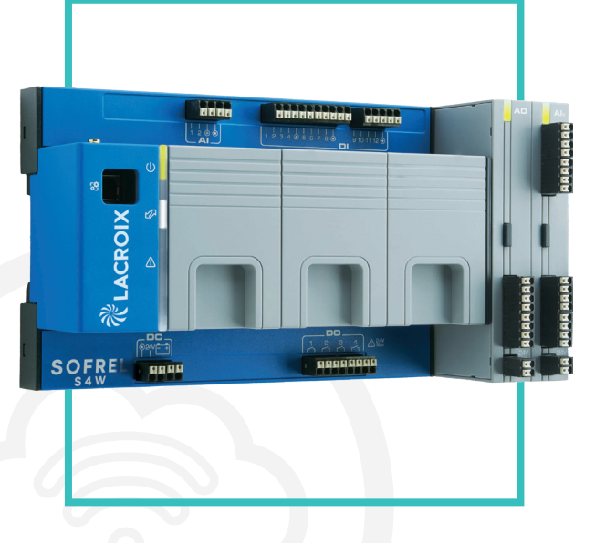
*4G available for Europe, Africa, Middle East. For other geographical areas please contact us.

Pumping - Drinking water and Wastewater treatment - Reservoir - Lifting station