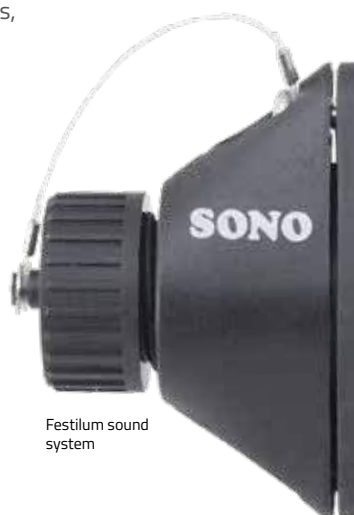
Festilum sound system