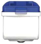
MPB Output at the bottom of the junction box