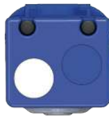
MPH Output at the top of the junction box