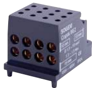
BE2 terminal block 2 to 4 x 2 inputs, 10mm 2 W 37mm