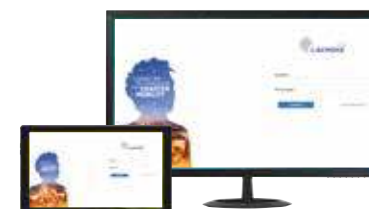
LX Connect online platform, Tegis Astroconnect functions (see p. 56-59)