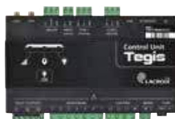
Tegis Astroconnect control unit (see p. 50-51)